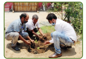
PMAY(U) Beneficiaries celebrating World Environment Day