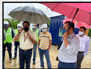
JS&MD at LHP Site, Lucknow